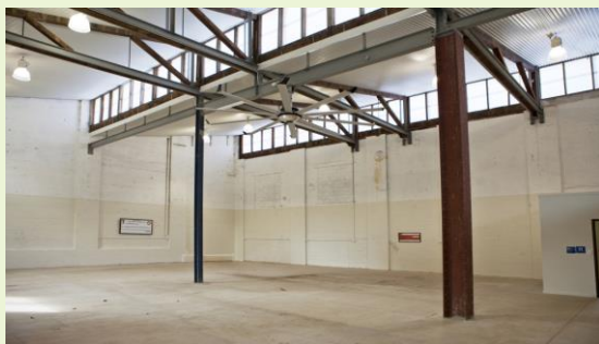
Pictured: Larsen Room

For bookings such as 18 th or 21 st birthday parties or the like, the event organiser must register the party with Party Safe through the Queensland Police Service with additional security to also be provided based upon the envisaged number of attendees.